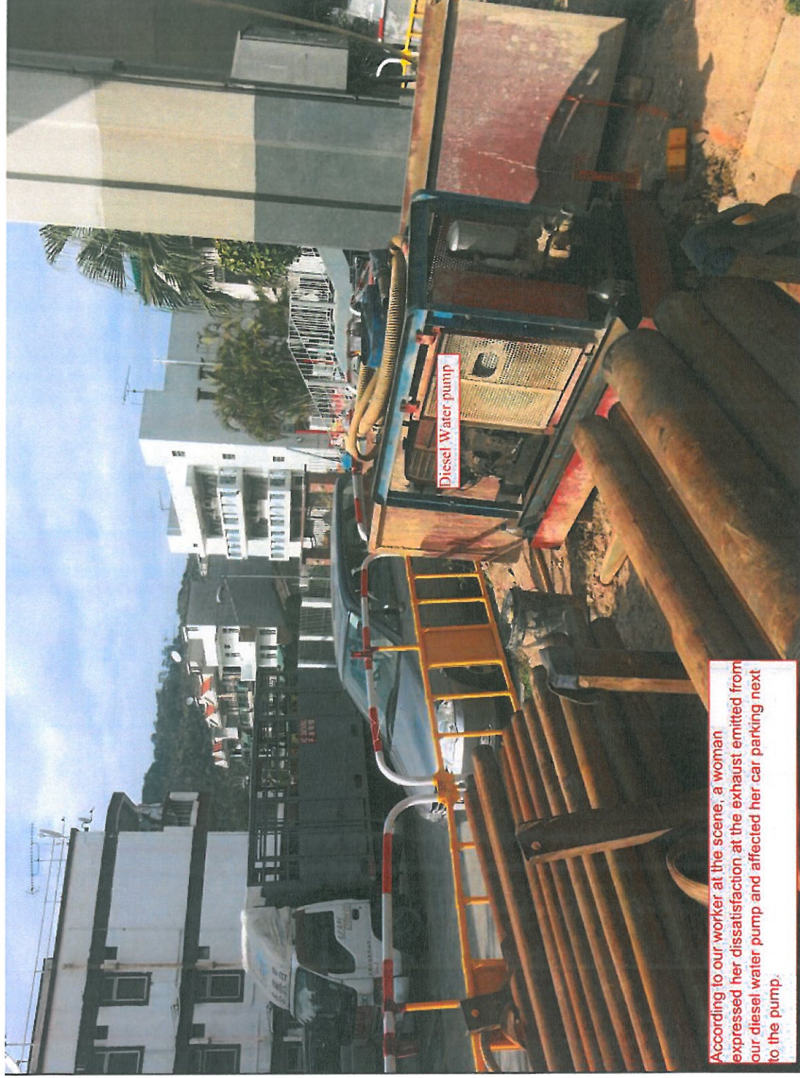
Figure 4 – No observed dust emission from the diesel water pump