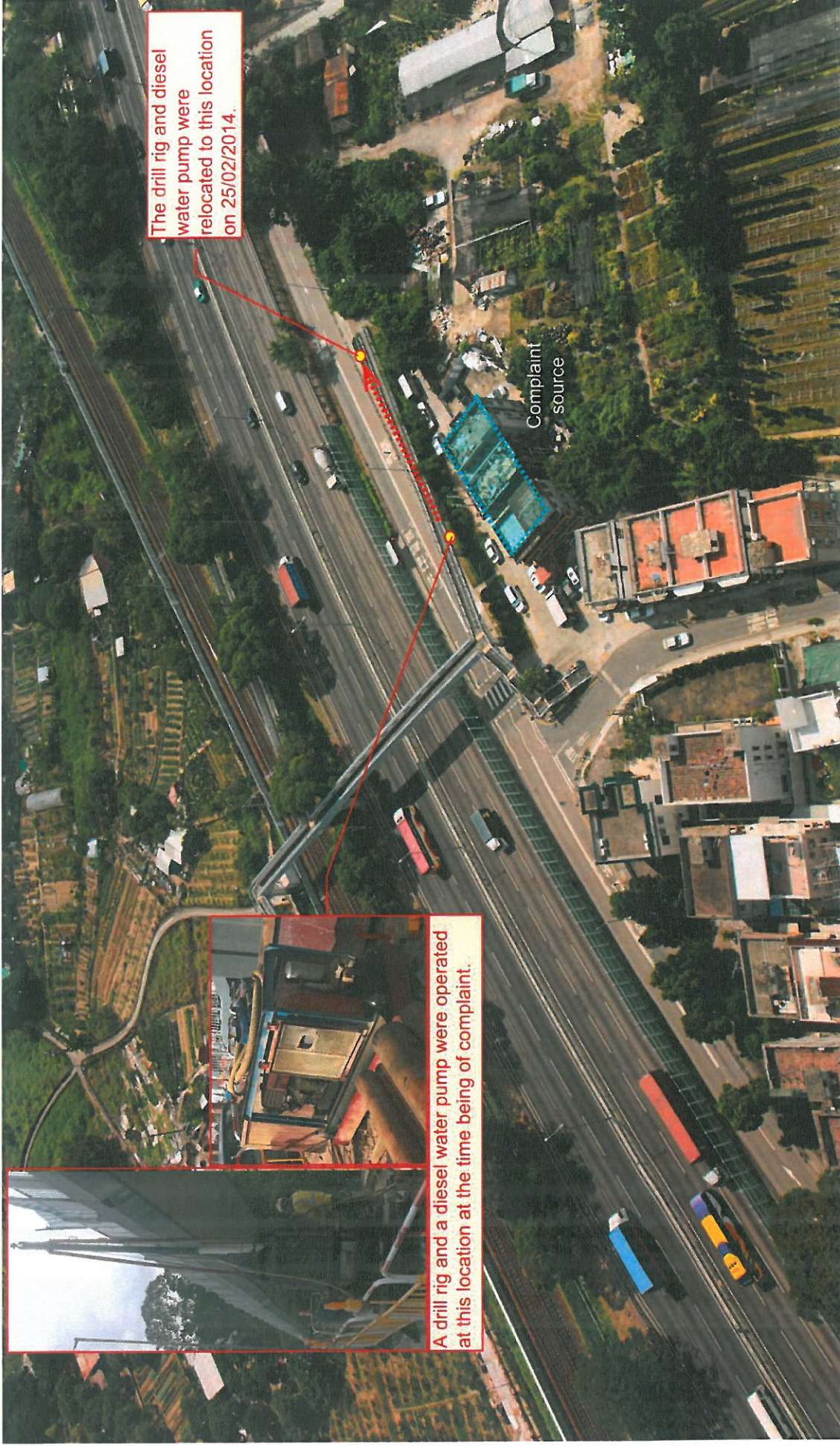
Figure 1A – The concerned drill rig and diesel water pump