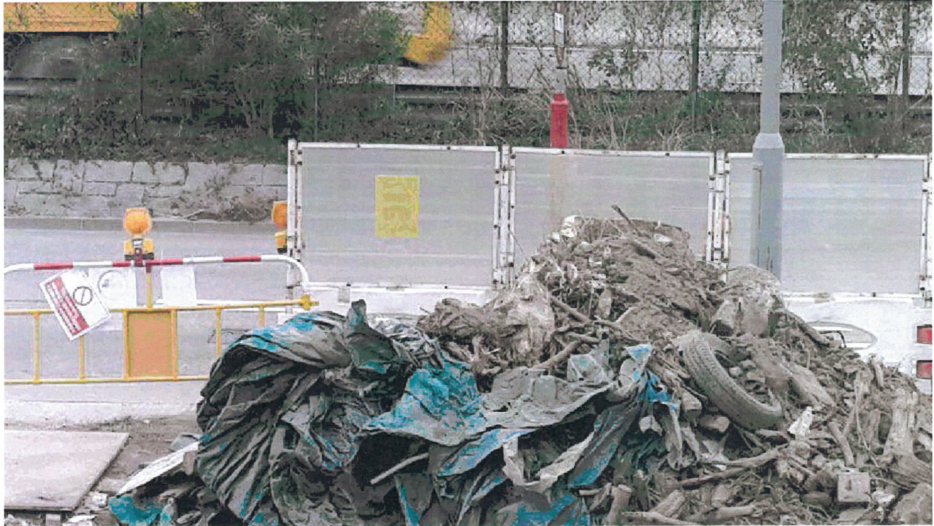
Figure 1 - Location of Complaint